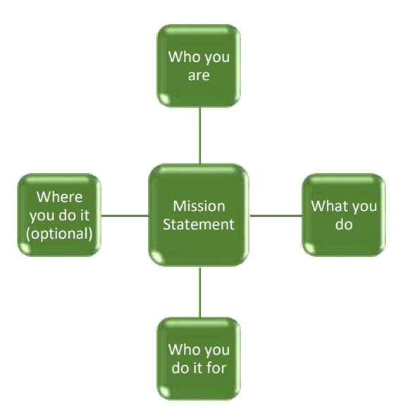
Figure 2. The four limbs of a mission statement

Additionally, the mission statement should have four limbs.