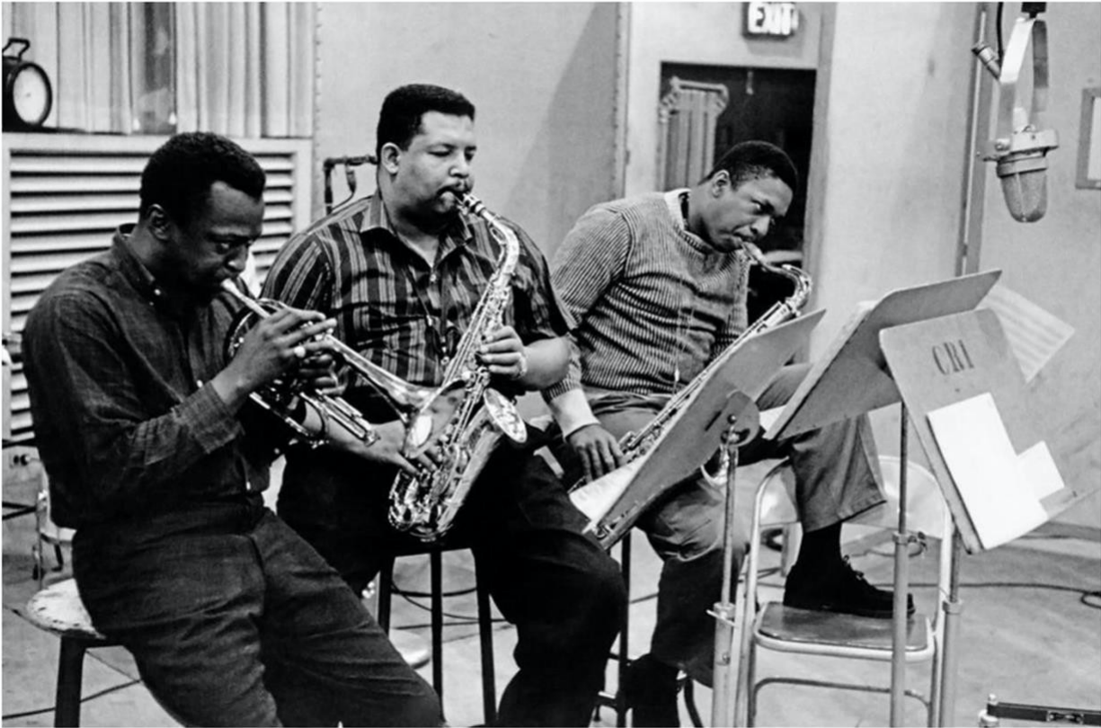
Miles Davis, Cannonball Adderley, John Coltrane. Our man in the middle. This iconic picture shows it all. The birth of the modern era in music.