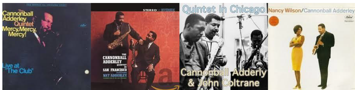
A few of the many albums by our FAMU Rattlers – Cannonball and Nat Adderley.

Let's bring the legacy of Cannonball and Nat Adderley home to Florida A&M University.