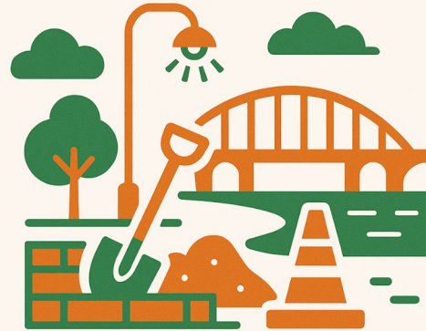
SITE IMPROVEMENTS AND INFRASTRUCTURE