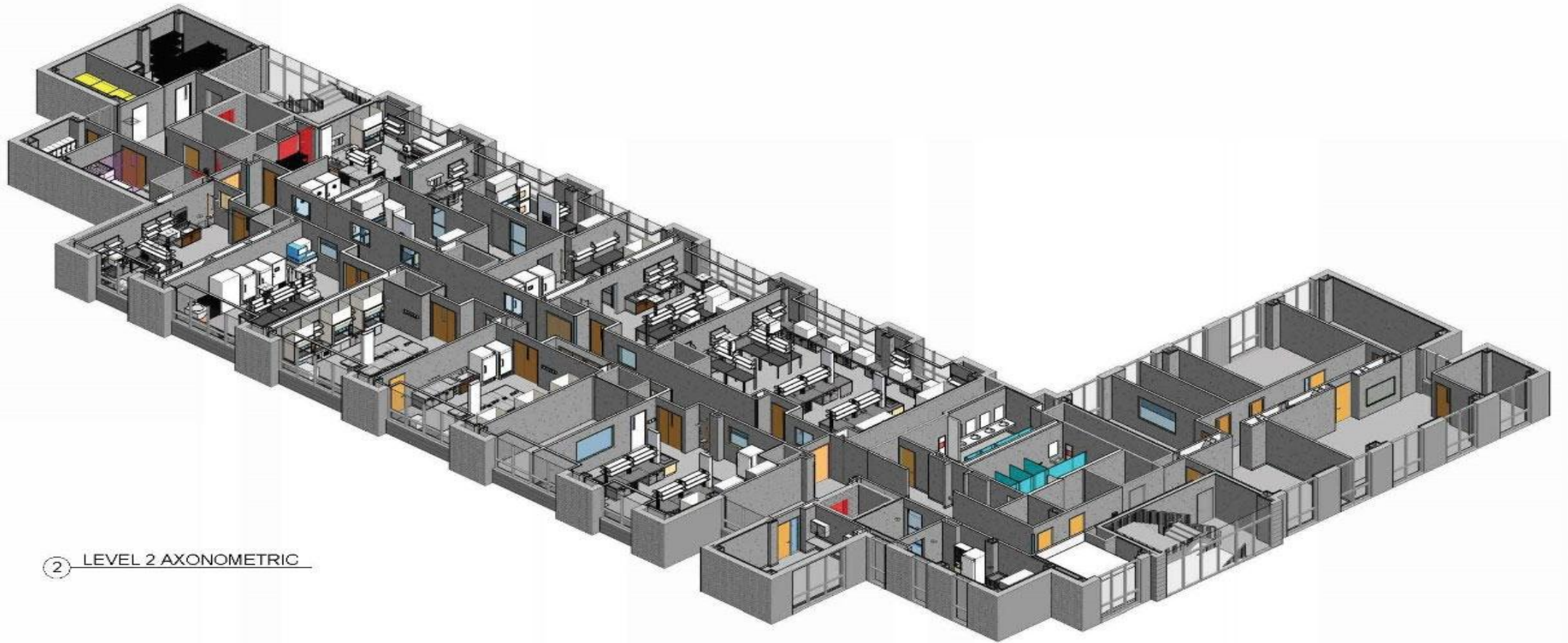
② LEVEL 2 AXONOMETRIC