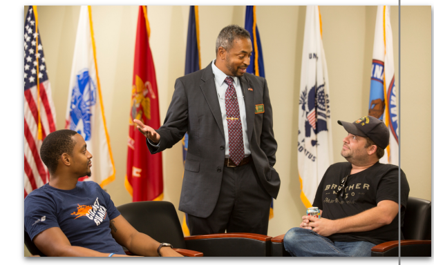
Organizational Effectiveness and Transformation