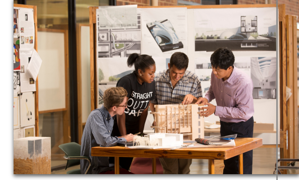
Long-Term Fiscal Health and Sustainability