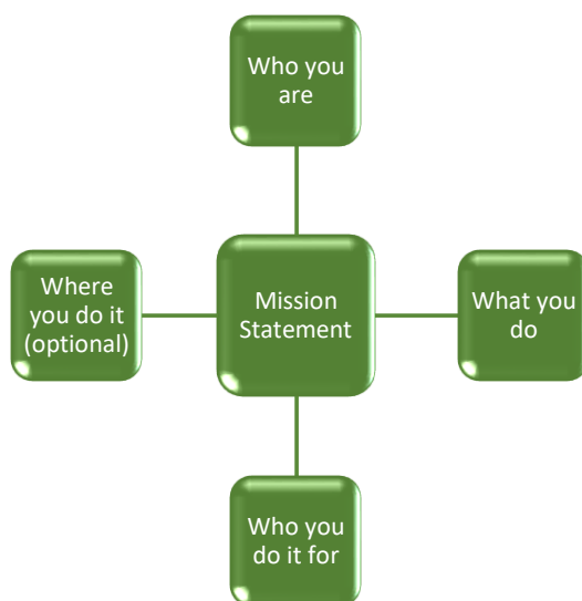
Figure 2. The four limbs of a mission statement

Additionally, the mission statement should have four limbs.